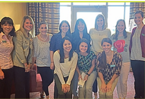
MOT students at Providence Point, Pittsburgh PA